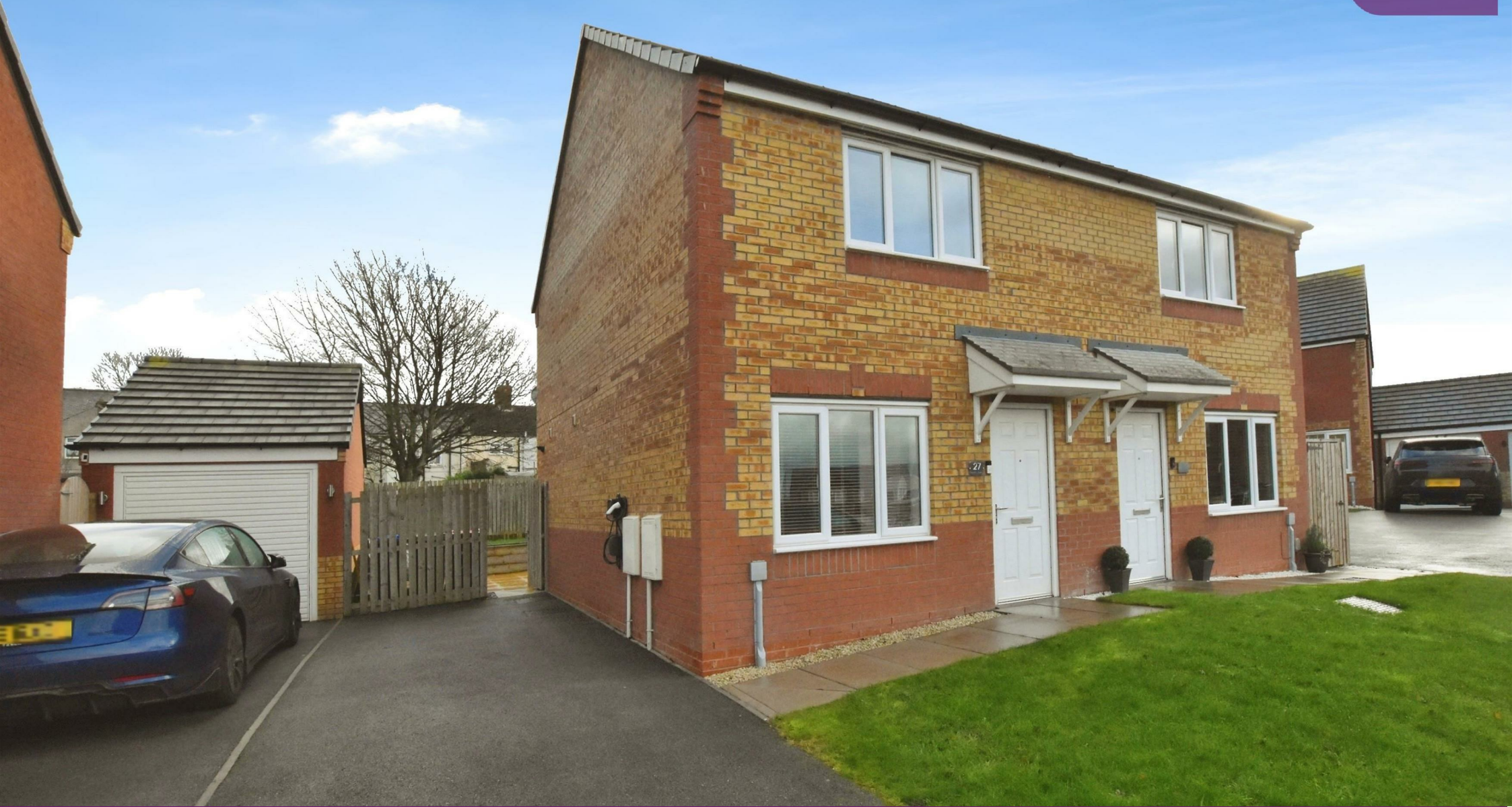
27 Manderley Gardens, Sutton-In-Ashfield, NG17 1LQ £169,950